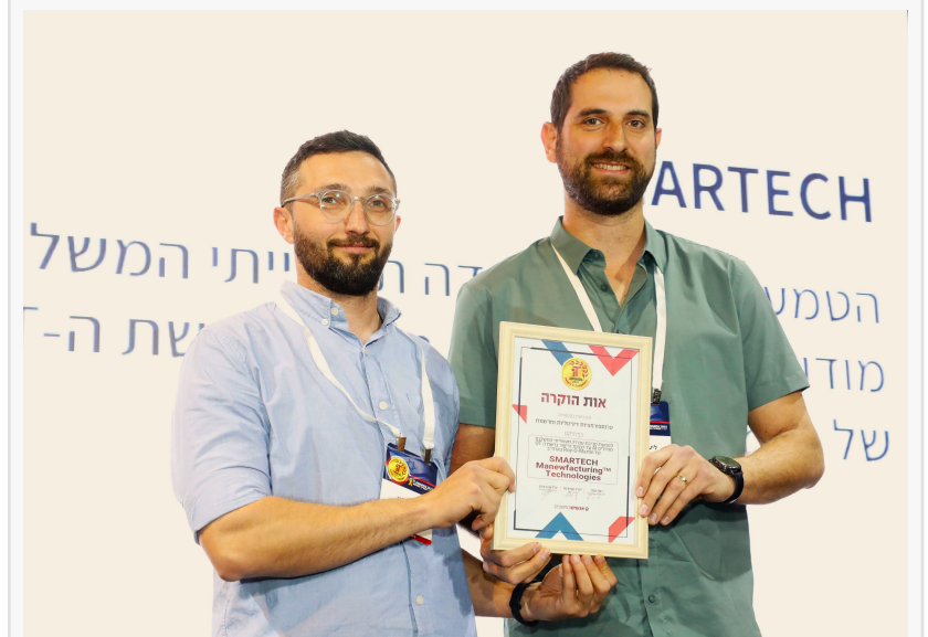
SMARTECH Wins for the Second Time Consecutively IT Award for its AI-Enabled Autonomous Manufacturing™