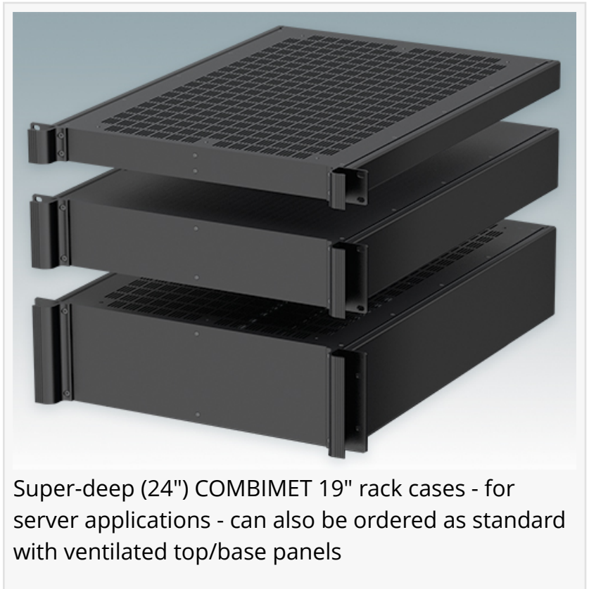
Super-deep (24") COMBIMET 19" rack cases - for server applications - can also be ordered as standard with ventilated top/base panels

This press release can be viewed online at: https://www.einpresswire.com/article/702034980