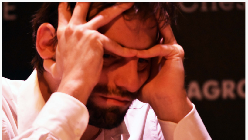
King Chess. Still Photo - Alexander Grischuk