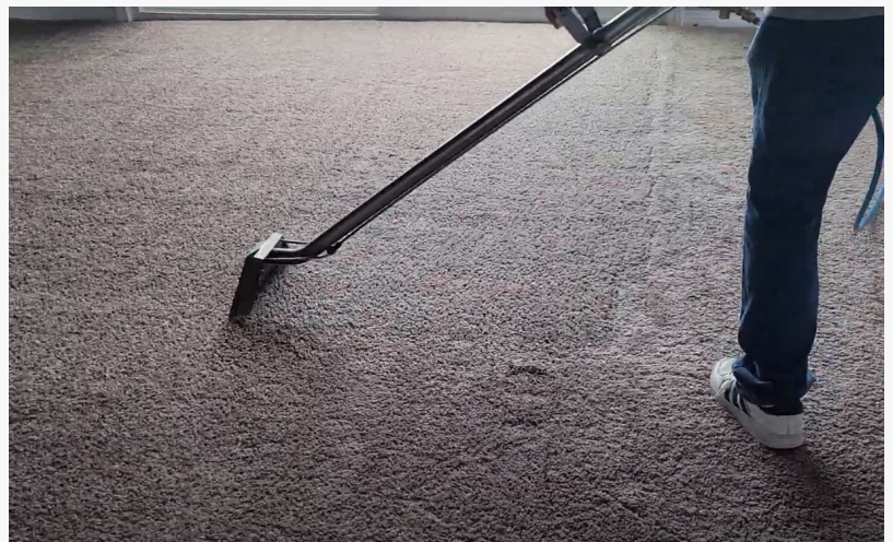
Sherman Oaks steam cleaning process