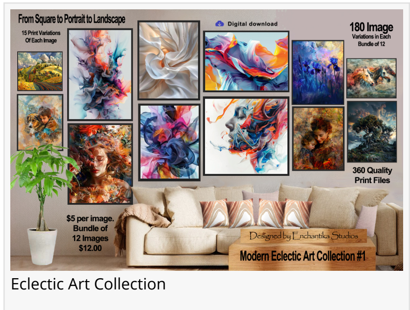
Eclectic Art Collection

MARICOPA, AZ, UNITED STATES, April 9, 2024 /EINPresswire.com/ -- Enchantika Studios announced the grand opening of its virtual storefront on Etsy, perfectly timed to coincide with Mother's Day celebrations. With a diverse collection that ranges from peaceful digital prints of nature to vibrant abstract masterpieces, Enchantika Studios said that it pledges that the joy of art is to remain accessible to all. To that end, they have priced all artwork between $1 and $5.