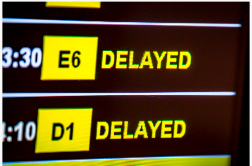
Global Pilot Shortage

The pilot shortage is a complex issue that has been brewing for years, and its impacts are now