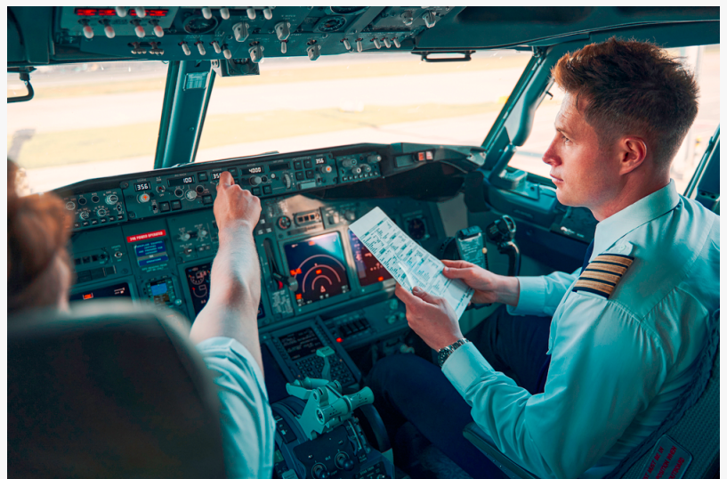
Fighting Global Pilot Shortage