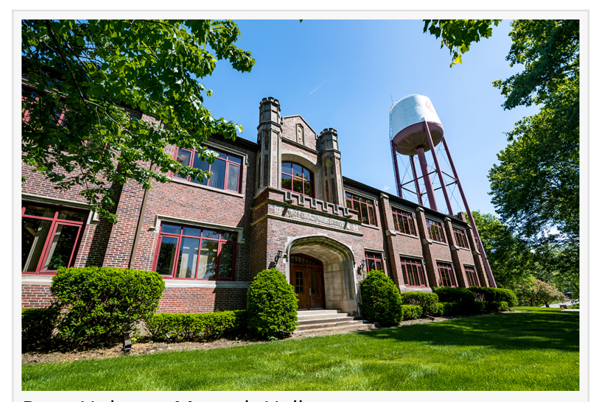
Rose-Hulman: Moench Hall

TERRE HAUTE, IN, UNITED STATES, April 9, 2024 /EINPresswire.com/ -- A special campus Sesquicentennial Celebration on April 4 had students, faculty, and staff commemorating Rose-Hulman Institute of Technology's 150-year legacy as a leader of undergraduate science, engineering, and mathematics, while also ushering in the next chapter of the Institute's future through the