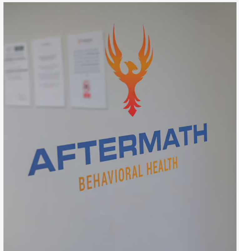
Aftermath Behavioral Health Logo

Intensive Psychiatric Outpatient care is ideal for those with diagnoses like depression or anxiety but still want a flexible treatment schedule. This program is best accompanied by individuals with a strong support system to boost the healing effects of multi-layered therapies.