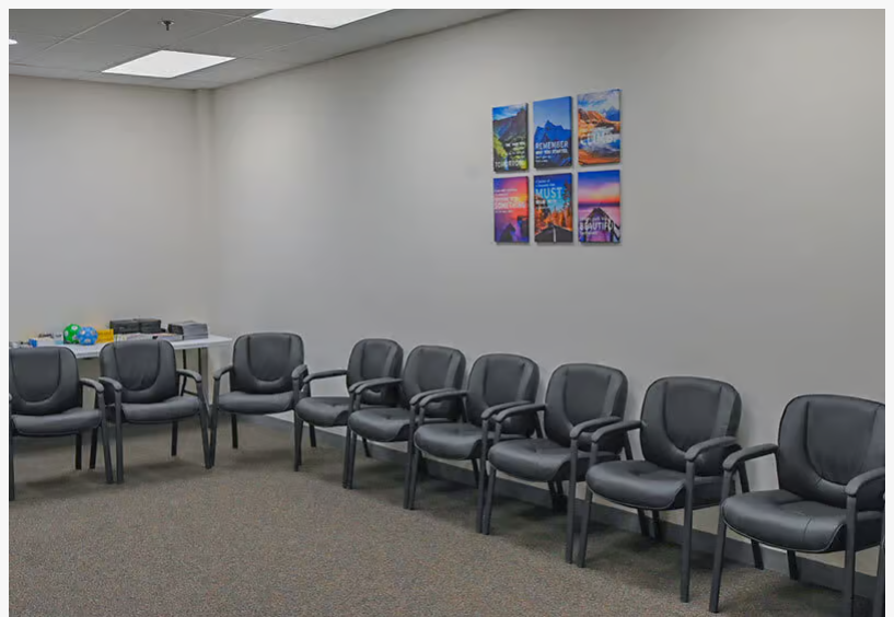
Aftermath Behavioral Health Group Therapy Facility