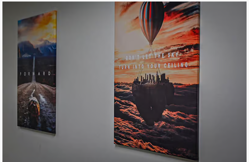
Aftermath Behavioral Health Wall Affirmations

This press release can be viewed online at: https://www.einpresswire.com/article/702308339