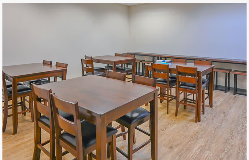
Aftermath Behavioral Health Facility

Aftermath Behavioral Health is a leading mental health care provider specializing in comprehensive and empathetic support for those facing mental health challenges. The