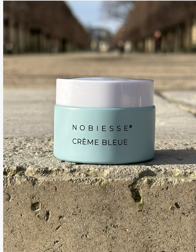
Nobiesse Creme Bleue with Methylene Blue Anti Oxidant

Nobiesse's innovative skincare solutions, particularly the Methylene Blue Bar Soap and Creme Bleue, are at the forefront of a scientific revolution, leveraging the distinct advantages of Methylene Blue in conjunction with the therapeutic properties of red and near-infrared (NIR) light energy. Our skin, the body's largest organ, not only serves as a protective barrier but also plays a crucial role in various physiological processes, including Vitamin D and melanin production, temperature regulation, and sensory perception. Clinical studies have illuminated Methylene Blue's potential to invigorate skin cells, boosting the production of collagen and elastin—key components that maintain the skin's elasticity and firmness. This increase in cellular activity not only delays cellular aging but also leads to tangible improvements in skin thickness, hydration, and