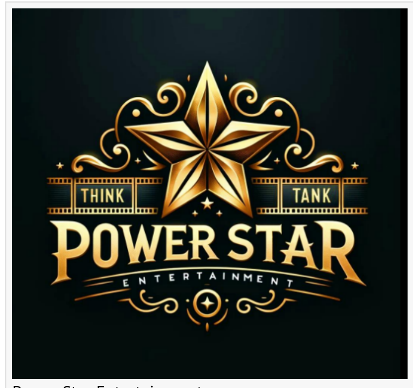
Power Star Entertainment