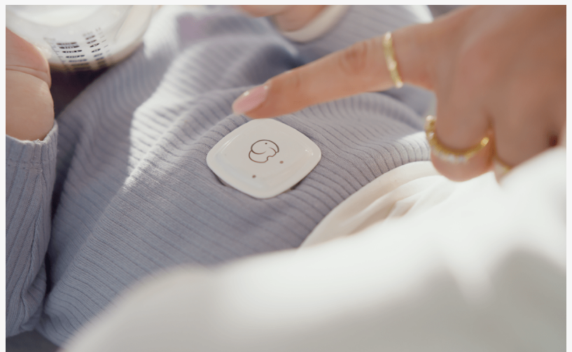
Elora Baby Wellness Monitor speech-to-text feature

Inspired by parents’ smartwatch tech, Elora uses AI to track crying sounds, sleep patterns, moods, and development-supporting activities such as tummy time, feeding, nutrition, playing time, engaging conversations with the baby, and key daily events direc