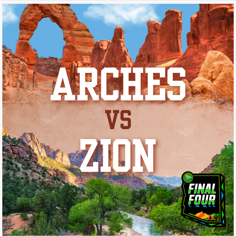
Parks Madness Final Four

As by far the most visited U.S. national park, No. 2 seed Great Smoky Mountain seemed well-provisioned to trek past No. 1 seed Zion. Park fan Thomas Grady even laid out the statistics: “The Great Smoky Mountain National Park: (a) is the most biologically diverse national park; (b) is the most visited national park and (c) has 150 official hiking trails covering approximately 900 miles, including 72 miles (1/30th) of the Appalachian National Scenic Trail.” But like a flash flood in the Virgin River Narrows, Zion’s fans swept it to a convincing win, 62-38%.