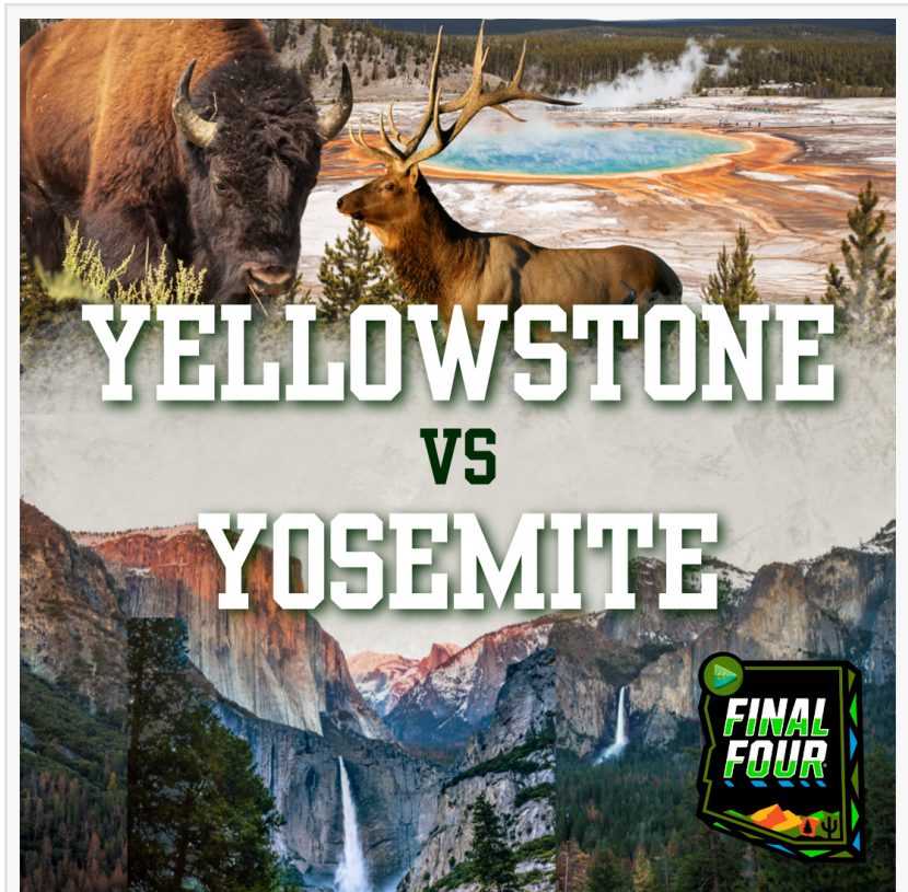
Parks Madness Final Four