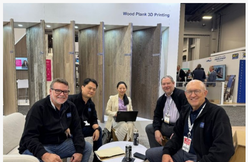
Northann's Benchwick Printing