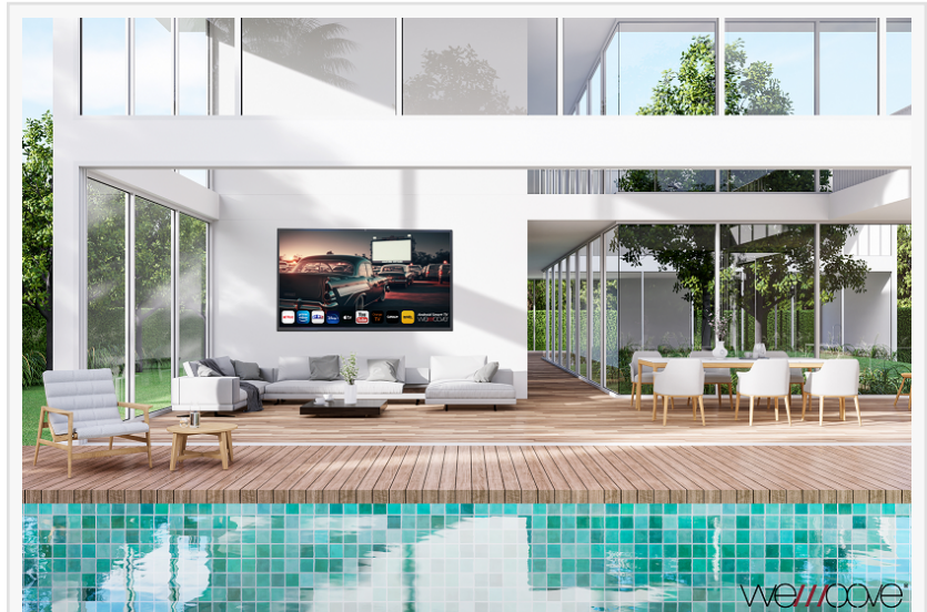
WEMOOVE OUTDOOR AND WATERPROOF TV IN AN OUTDOOR SWIMMING-POOL AREA

Powered by the Android TV 11 operating system, the new Smart Android™ waterproof TVs from