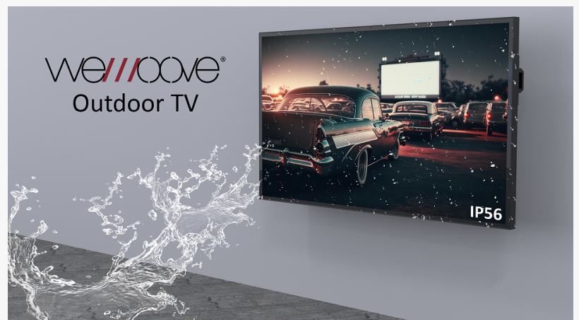
WEMOOVE OUTDOOR AND WATERPROOF IP56 TV