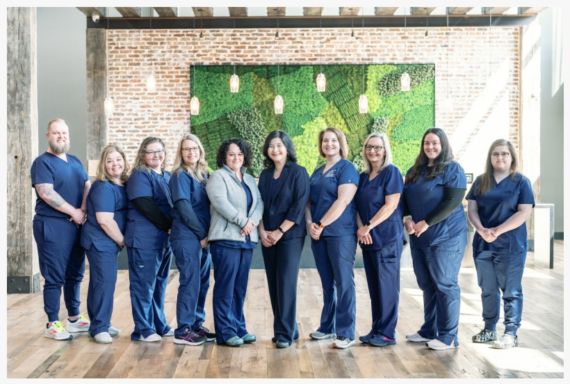
Staff Members at Lake Cumberland Rheumatology in Lexington, KY