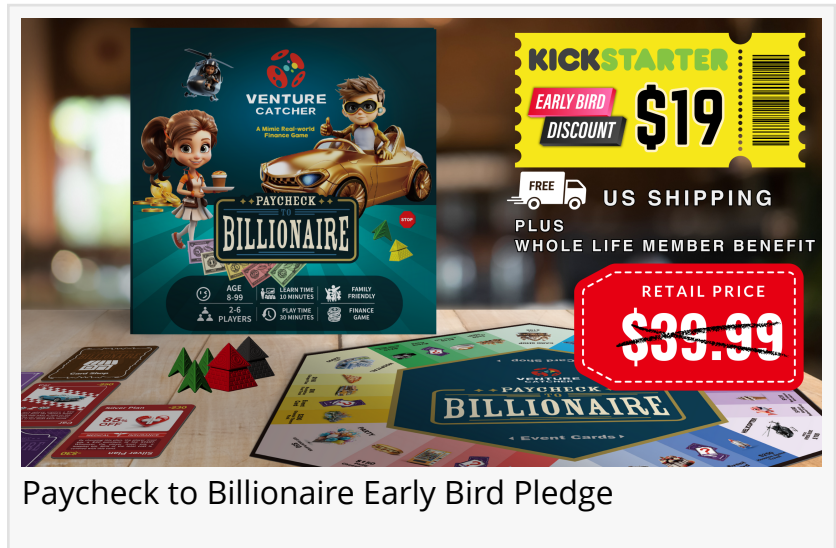
Paycheck to Billionaire Early Bird Pledge

The official Kickstarter preview page is now live, inviting future backers to sign up for notifications about the launch date and access exclusive early bird specials. (Link: https://www.kickstarter.com/projects/venturecatcher/paycheck-to-billionaire-board-game-meets-financial-freedom )