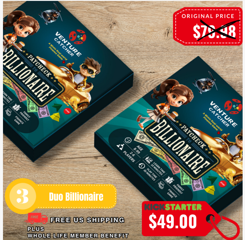
Paycheck to Billionaire Tycoon Pledge

This press release can be viewed online at: https://www.einpresswire.com/article/702711654 EIN Presswire's priority is source transparency. We do not allow opaque clients, and our editors try to be careful about weeding out false and misleading content. As a user, if you see something we have missed, please do bring it to our attention. Your help is welcome. EIN Presswire, Everyone's Internet News Presswire™, tries to define some of the boundaries that are reasonable in today's world. Please see our Editorial Guidelines for more information. © 1995-2024 Newsmatics Inc. All Right Reserved.