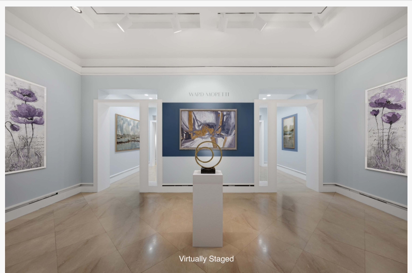
11 East 70th Street | Turnkey condition with multiple exhibit spaces and private outdoor space

Concierge Auctions is the world's best luxury real estate auction marketplace, with a state-of-the-art digital marketing, property preview, and bidding platform. The firm matches sellers of one-of-a-kind homes with some of the most capable property connoisseurs on the planet. Sellers gain unmatched reach, speed, and certainty. Buyers receive curated opportunities. Agents earn their commission in 30 days. Acquired by Sotheby's, the world's premier destination for fine art and luxury goods, and Anywhere Real Estate, Inc (NYSE: HOUS), the largest full-service residential real estate services company in the United States, Concierge Auctions continues to operate independently, partnering with real estate agents affiliated with many of the industry's leading brokerages to host luxury auctions for clients. For Sotheby's International Realty listings and companies, Concierge Auctions provides Sotheby's brand exclusivity as Sotheby's Concierge Auctions. Since inception in 2008, the firm has generated billions of dollars in sales, broken world records for the highest-priced homes ever sold at auction and conducted auctions in 46 U.S. states and 38 countries. The firm owns one of the