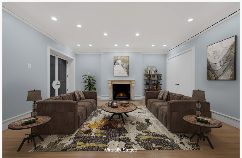
15 East 70th Street | World Premiere location adjacent the Frick