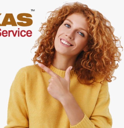
Texas Electric Service - Electric Choice