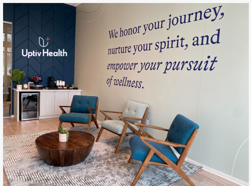
Welcoming and warm atmosphere is everywhere at the clinic

/EINPresswire.com/ -- Uptiv Health, a leading and tech-enabled provider of infusion and injection therapy, today announced the grand opening of its newest infusion center, located at 283 E. Big Beaver Road, Troy, Michigan 48083. The opening accelerates Uptiv Health's rapid growth in the Detroit metro area, transforming the infusion and injection experience with a whole person care approach, combining clinical excellence with modern comfort.