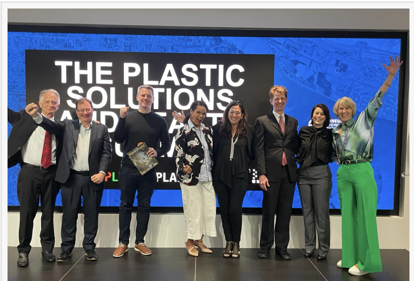
Plastic Solutions & Health Summit

Those in attendance included representatives of the US Environmental Protection Agency, United States Department of Agriculture, Dow Chemicals, Exxonmobil, and U.S. Food and Drug Administration.