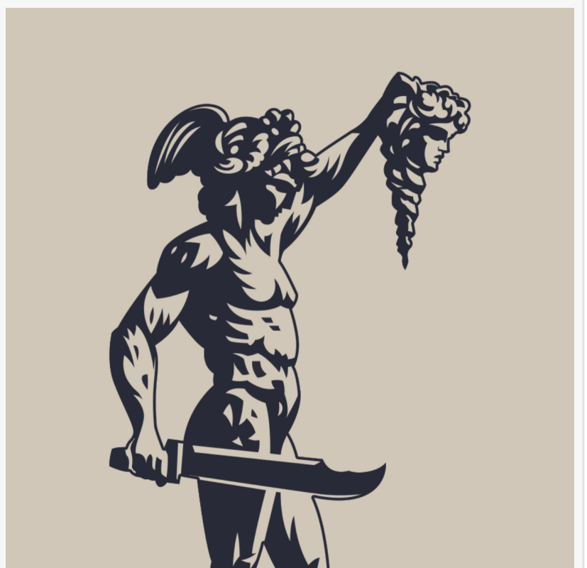
Perseus Performance Coaching

Recognizing and accommodating these varied preferences is crucial for fostering a dynamic and resilient workforce. As organizations navigate the post-pandemic landscape, the study underscores the importance of adopting a flexible and inclusive approach to workplace design, leveraging technology to facilitate seamless transitions between in-office and remote environments.