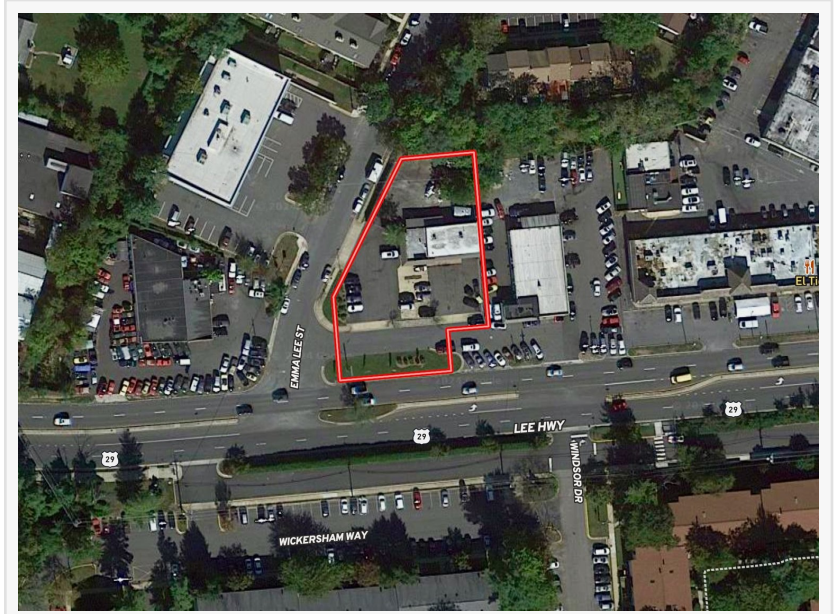
7714 Lee Highway, Falls Church, VA 22042