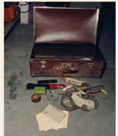
The Somerton Man Suitcase Contents, Serving as Tropes of His Staged Book of Death Poems