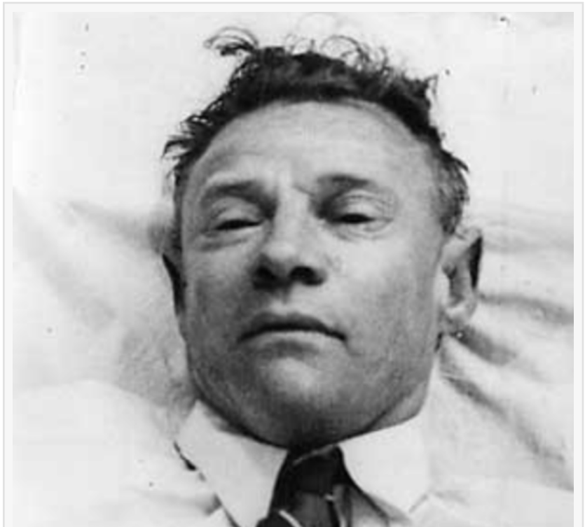
The Somerton Man Autopsy Photo