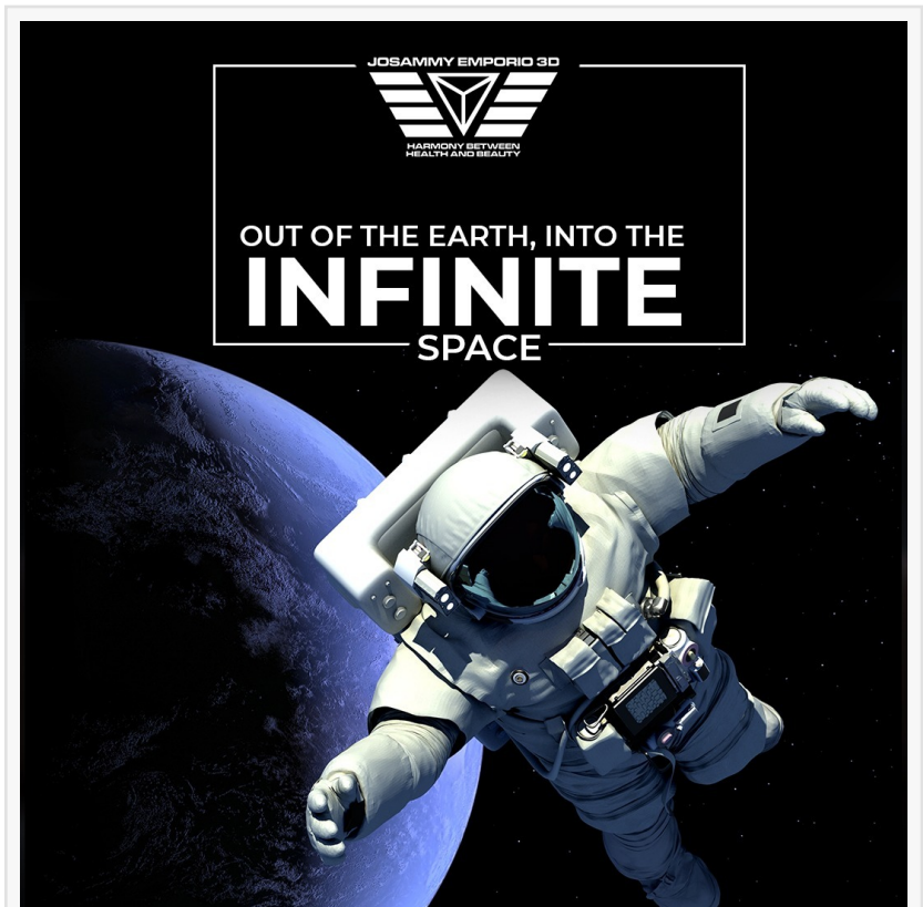
Antigravity Sigma ZG Matrix focuses on Quantum fluctuation, thermodynamics, and general relativity

The practical implications of the formulas discovered by Josammy Ganga are cosmic energy conversion, space travel propulsion, Black hole, gravitational energy, unified field equation, and Quantum entanglement probability reactivities formula in the process of quantum communication and quantum computing. Therefore, cosmic energy conversion process formula provides insights into how cosmic energy is converted within stars. It helps us understand processes like nuclear fusion, which powers stars and produces light and heat. Also, by considering the gravitational potential energy term, we gain a deeper understanding of black holes and their immense energy release during accretion processes.