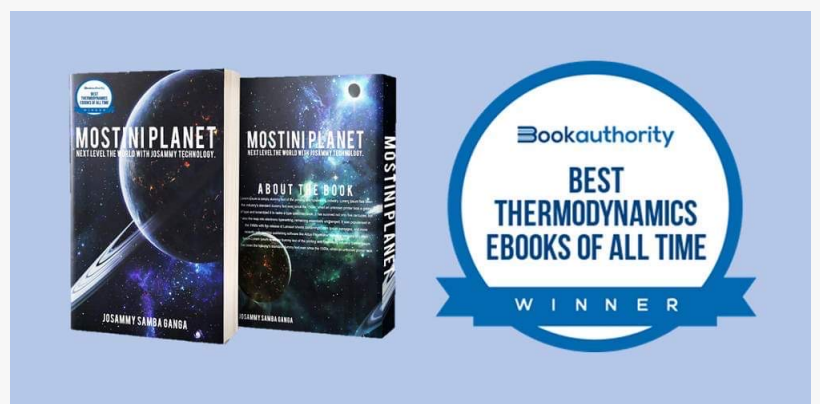
Finding a theory of everything is the major unsolved problems in physics