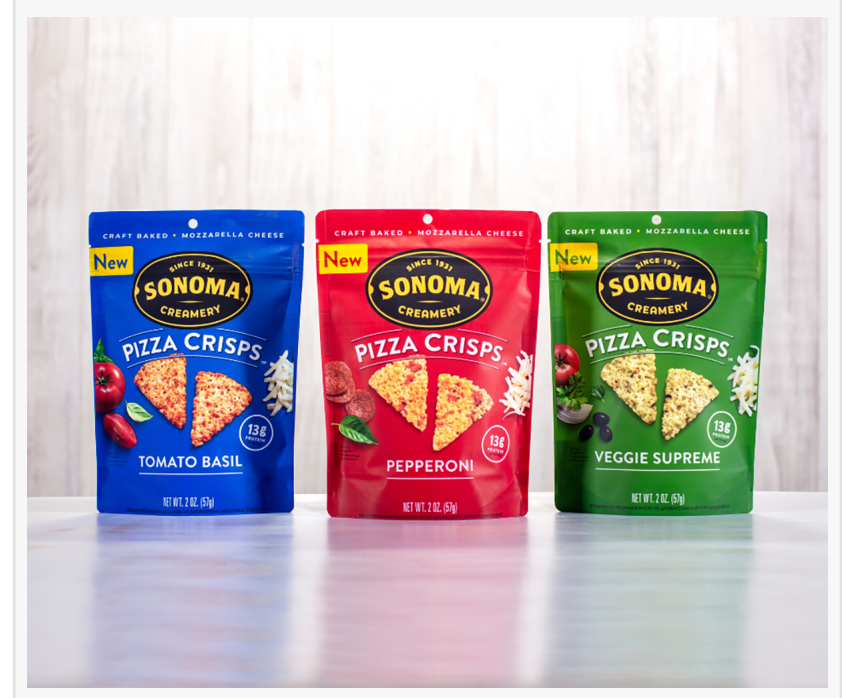
Sonoma Creamery® Pizza Crisp Flavors: Tomato Basil, Pepperoni, Veggie Supreme