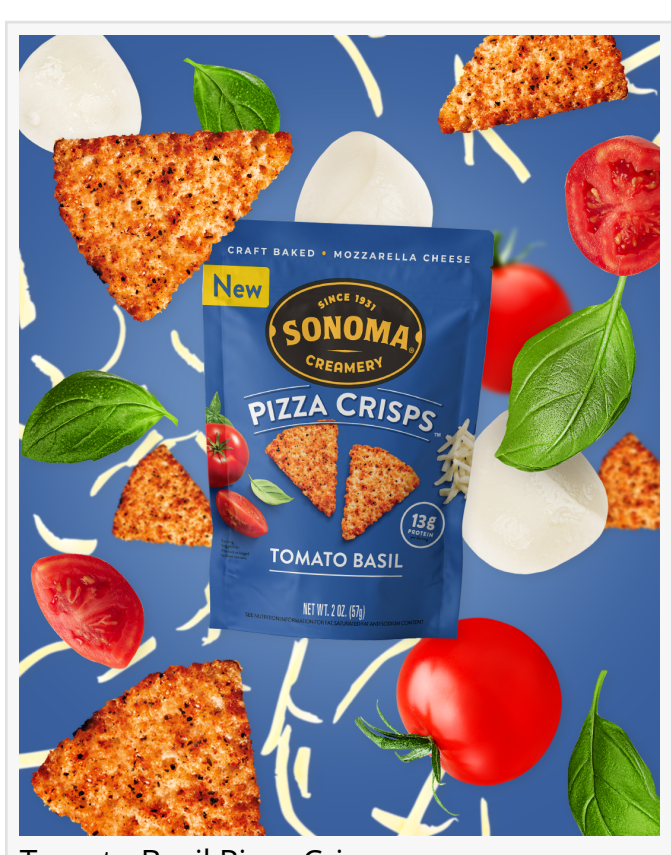
Tomato Basil Pizza Crisps

Tomato Basil Pizza Crisp™ captures the essence of a classic Margherita pizza in a convenient, bitesized format, providing members with a guilt-free snack option that is high in protein and glutenfree. Crafted with real mozzarella cheese and seasoned with ripe tomatoes, fragrant basil, and savory garlic, these crisps offer a burst of flavor with every bite. Whether enjoyed on their own or paired with a favorite dip, Tomato Basil Pizza Crisp™ promises to satisfy cravings and elevate snacking experiences.