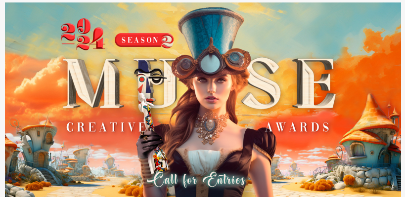
2024 MUSE Creative Awards S2 Call for Entries