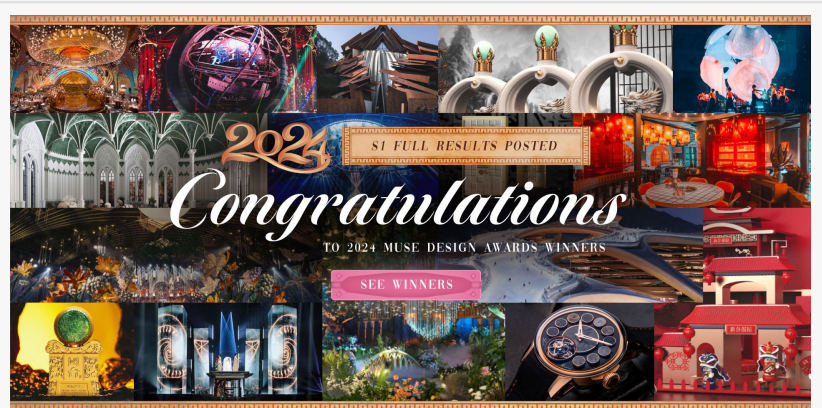
2024 MUSE Design Awards S1 Full Results Announced

As an international award platform, the MUSE Creative and Design Awards attracted entries from internationally renowned organizations. Some submissions were directly made by these companies, while others were submitted by entrants who had produced work for them. Direct submissions featured recognizable names such as Coach, NBCUniversal, CJ ENM, Gravity Global, Hong Kong Tourism Board, Aedas, Les Ateliers Louis Moinet SA, Ltd, Bells + Whistles, and Geely Design; while indirect submissions included Lay's / Netflix, Mattel, KFC, Walt Disney Studios,