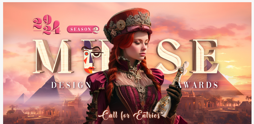
2024 MUSE Design Awards S2 Call for Entries