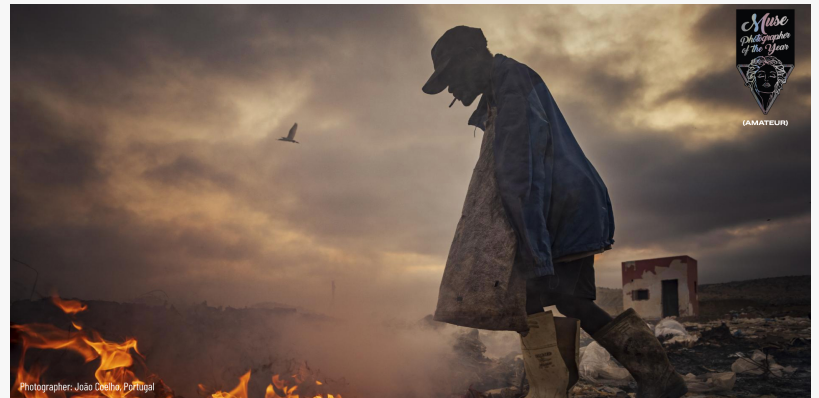
2024 MUSE Photographer of the Year (Amateur) - Scavengers