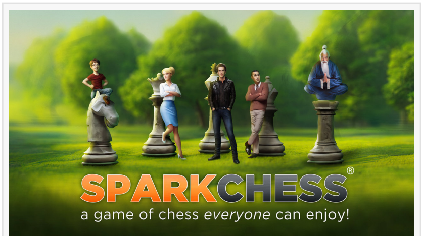
SparkChess promotional image showcasing its AI characters

Armand Niculescu Media Division SRL info@sparkchess.com Visit us on social media: Facebook X Instagram YouTube