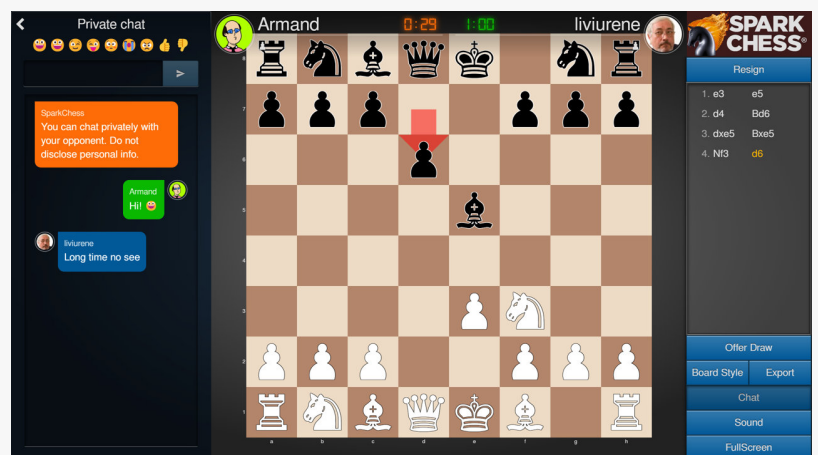
SparkChess in a multiplayer game with a diagram board and chat