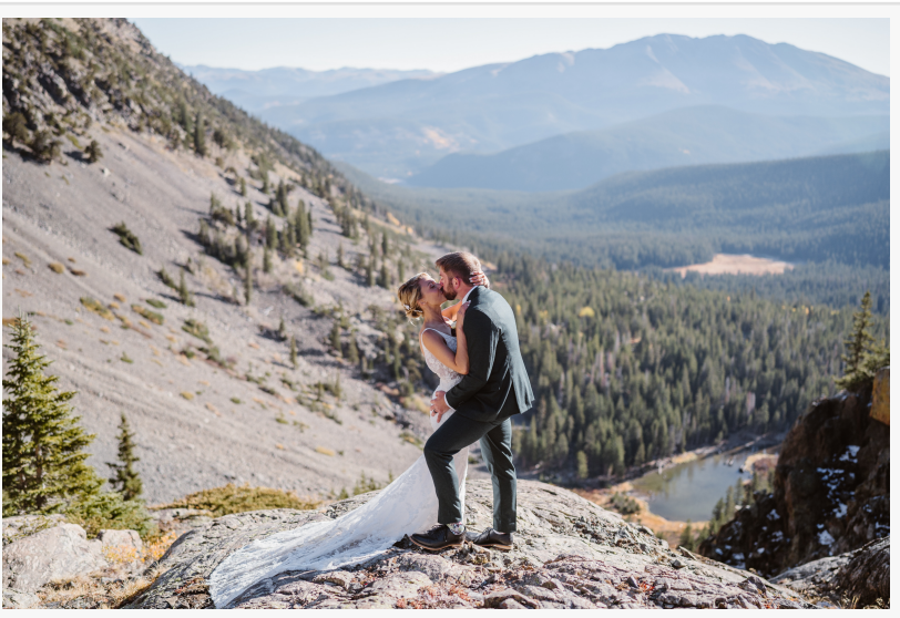
Vows and Peaks - Colorado Elopement

The package offers four options, each varying in hours and pricing, with