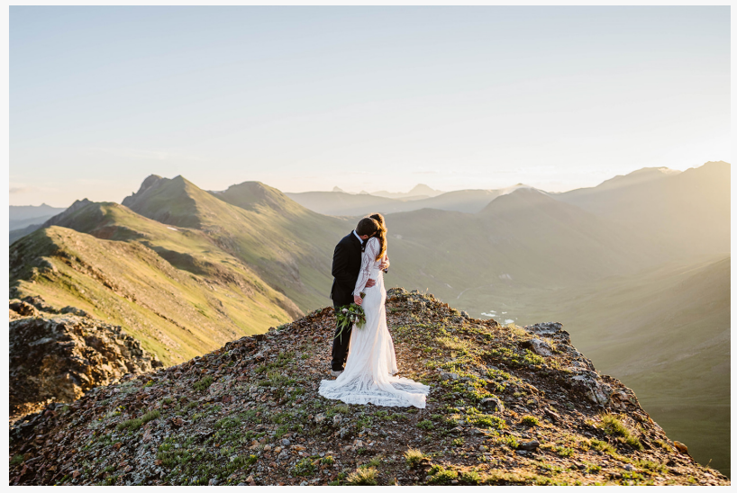
Vows and Peaks - Colorado Off Roading Elopement

planning services tailored to match the couple's style, personality, and preferences. From personalized planning and timelines to vendor coordination and expert photography, every aspect is meticulously arranged to ensure a seamless and enchanting experience.