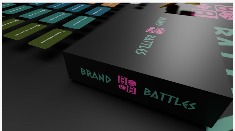
Brand Battles Board Game