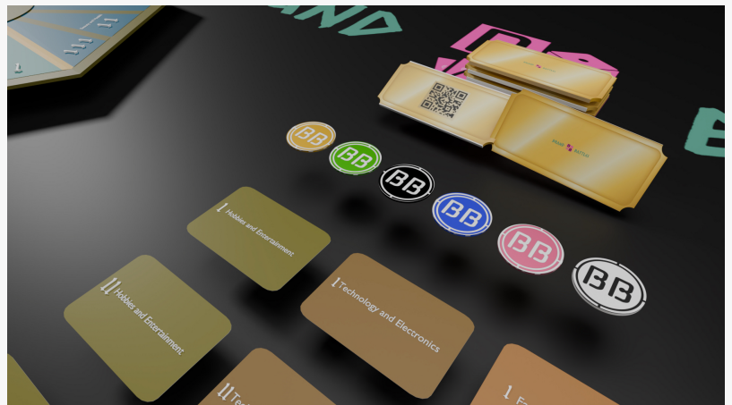
Gaming Cards, Tokens, Brand Coupons