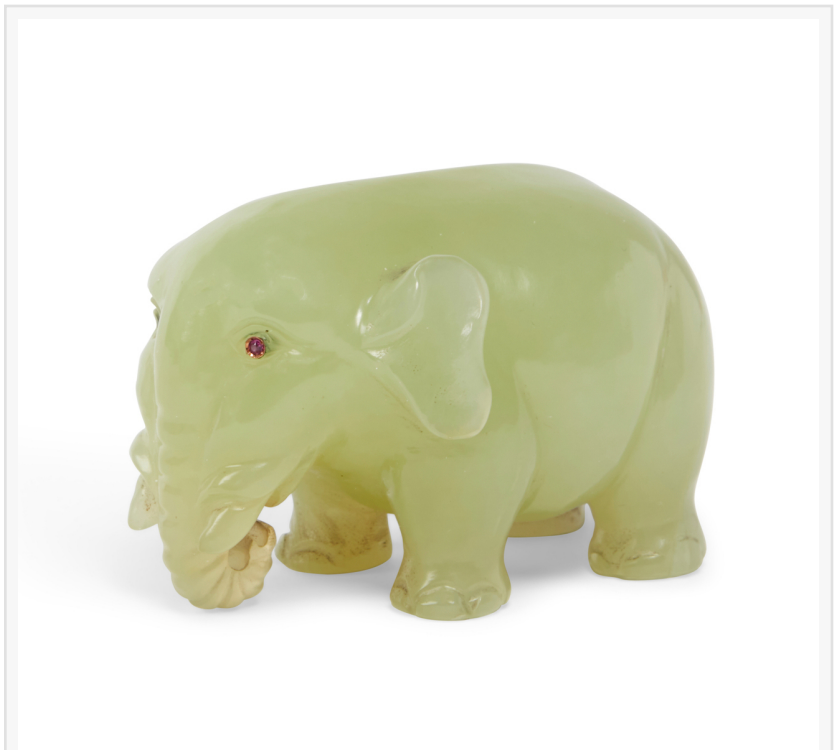
Circa 1900 Fabergé gem-set bowenite model of an elephant (est. $5,000-$7,000).

The home was wonderfully appointed with European and English furniture, including a Louis XV/XVI Transitional tulipwood and amaranth commode by Flemish master cabinet maker Daniel de Loose (est. $3,000-$5,000); an imposing Italian Neoclassical walnut settee (est. $2,000-$3,000); a handsome pair of George III mahogany cockpen armchairs (est. $3,000-$5,000); an intricately inlaid George III mahogany and