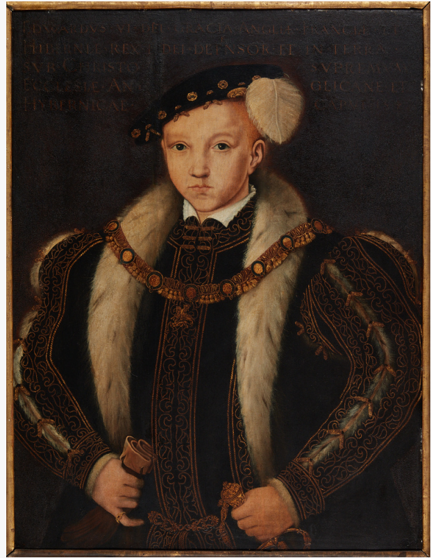
16th century English School portrait of King Edward VI, measuring 29 inches by 22 ¼ inches (est. $30,000-$50,000).

Other fine art highlights include a large scale and colorful post cubist vista of Cetara, Italy, 1932 by Károly Patkó (est. $10,000-$15,000); a British Boar by Sir Edwin Henry Landseer (est. $10,000-$15,000); Raimonds