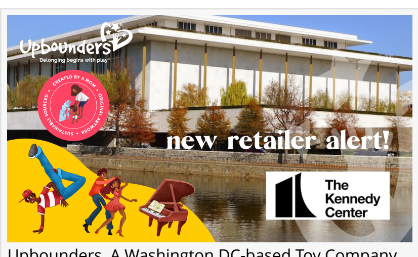
Upbounders, A Washington DC-based Toy Company Now Available at The Kennedy Center

WASHINGTON, DC, DISTRICT OF COLUMBIA, USA, April 12, 2024 /EINPresswire.com/ -- Upbounders<sup>®</sup> toys are now available at the prestigious Kennedy Center, the ultimate hotspot for culture and creativity.