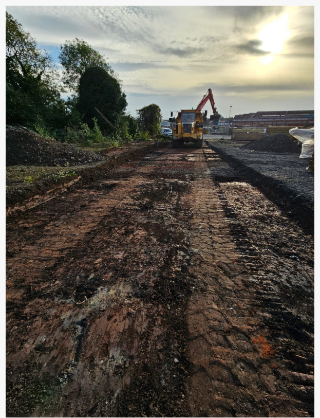
Works underway on Terra Firma Energy's new BESS Project

Terra Firma Energy Limited is a privately owned U.K. based Independent Power Producing company operating in the development of renewable & sustainable energy projects. We design,