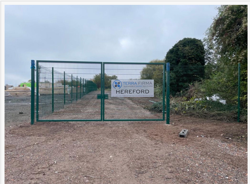
Entrance to Terra Firma Energy's BESS project in Hereford