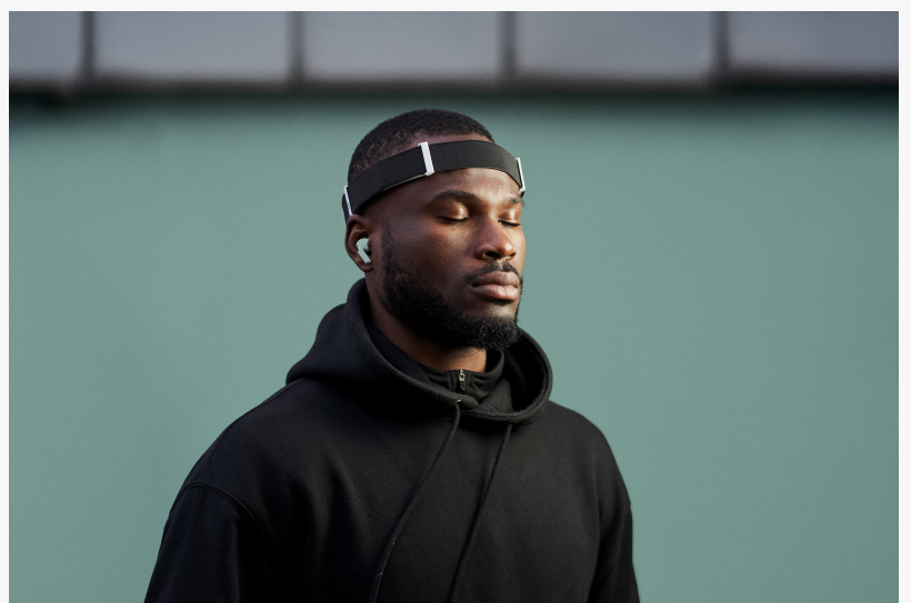
alphabeats fits easily into a daily routine

LOS ANGELES, CA, UNITED STATES, April 15, 2024 /EINPresswire.com/ -- alphabeats , a leader in neurotech for athletes, announced it has opened U.S. pre-orders today for its flagship offering. alphabeats leverages the power of music-driven neurofeedback to elevate mental performance, focus, and recovery with an intuitive app and EEG headband. Designed for the rigorous demands of elite athletes, this novel approach to mental conditioning sets new standards in sports training and wellness.