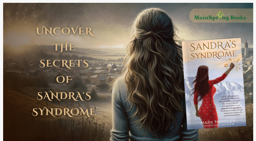
Sandra's Syndrome: An Uncommon Love Story of True-Life Fiction