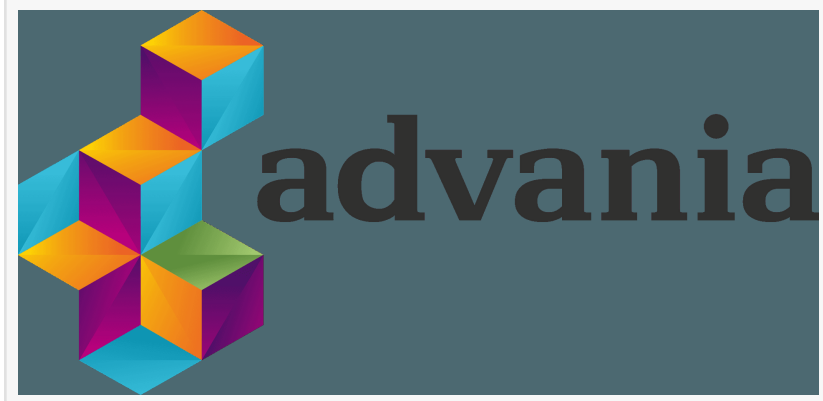
Advania is "The tech company with people at heart," operating across Sweden, Norway, Iceland, Finland, Denmark, and the UK

More than just a standard templating and governance tool for Microsoft Teams, Orchestry's comprehensive platform will enable Advania Finland to support clients with governance in SharePoint Online, Microsoft Planner, Microsoft Lists, Microsoft OneNote as well as other Microsoft 365 business applications through a single, unified interface.