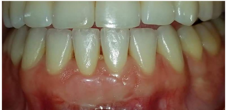
Soft Tissue Graft Repair Post-Orthodontic Expansion Defect