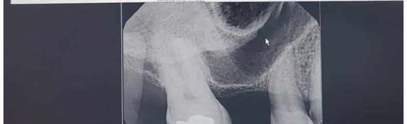
Piezo Sinus Graft Elevation Surgery