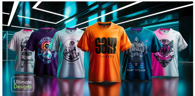
ingLando Ultimate Designs