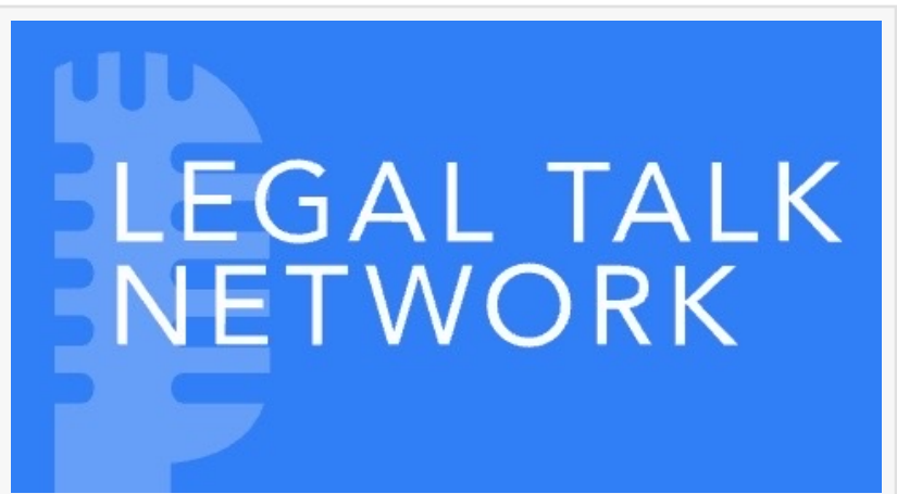
Legal Talk Network