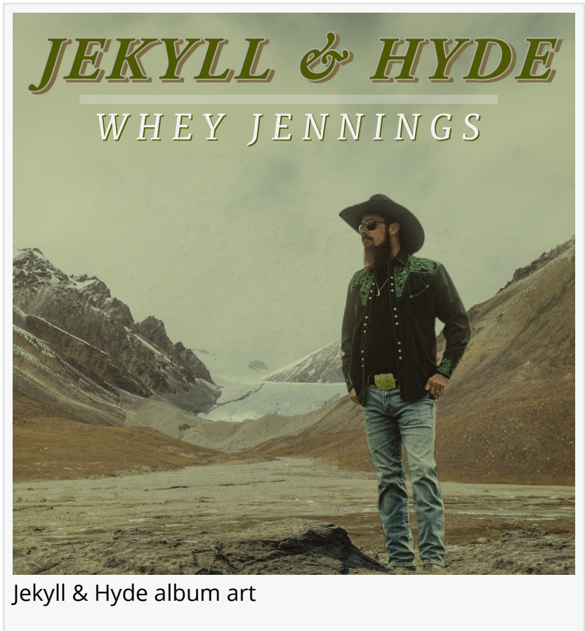
Jekyll & Hyde album art