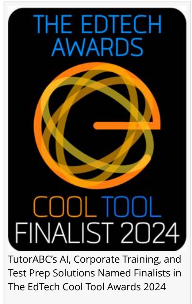
TutorABC's AI, Corporate Training, and Test Prep Solutions Named Finalists in The EdTech Cool Tool Awards 2024