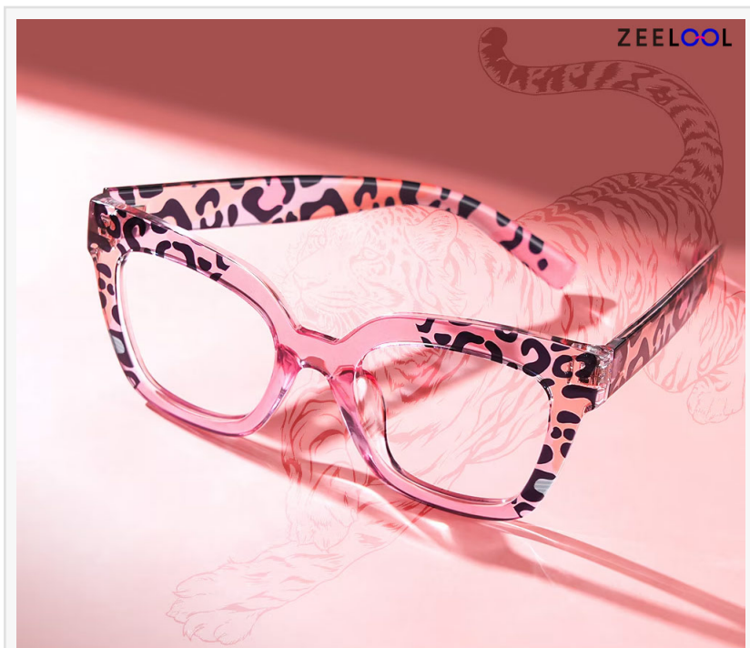
ZEELOOL Leopard Print Glasses