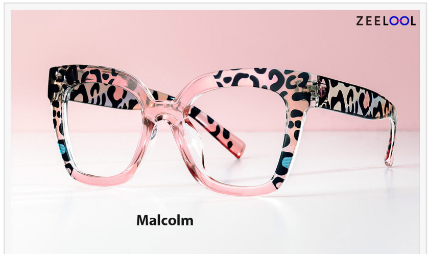
Pink Leopard Print Glasses