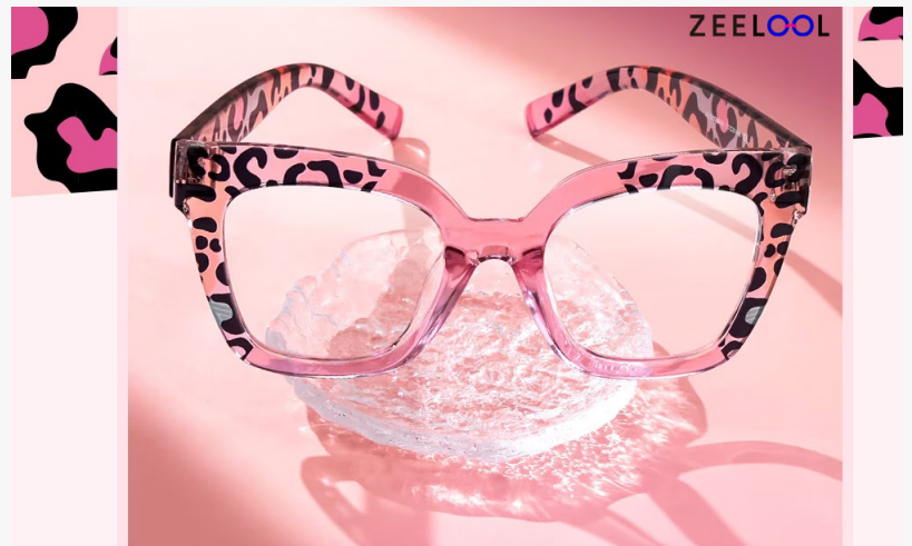
Leopard print glasses