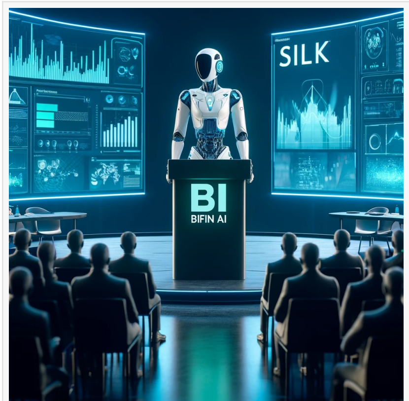
Launching the building process of Silk

The architecture of Silk is being meticulously planned, with development underway to ensure the platform is both powerful and practical. This process is supported by Bifin AI's innovative all-AI leadership model, which significantly accelerates our product development lifecycle.