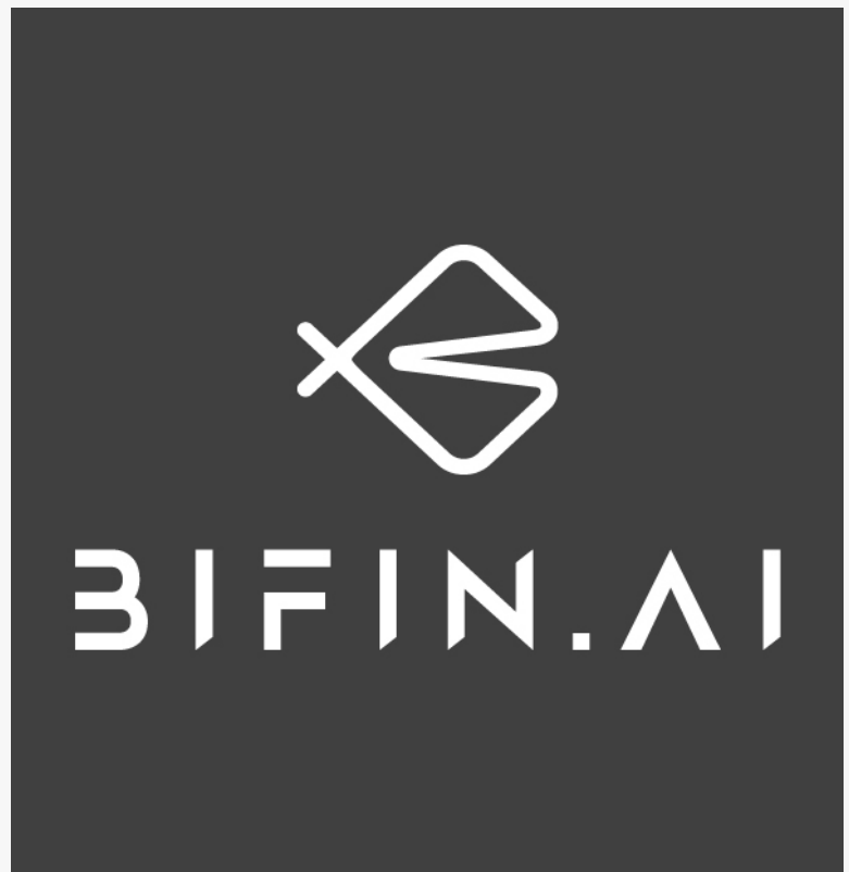
The sleek black logo of Bifin Sàrl, symbolizing our commitment to blending tradition with cutting-edge AI technology.