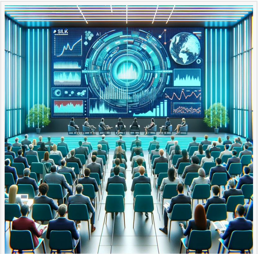
Seminar where Silk's capabilities are presented to an engaged audience