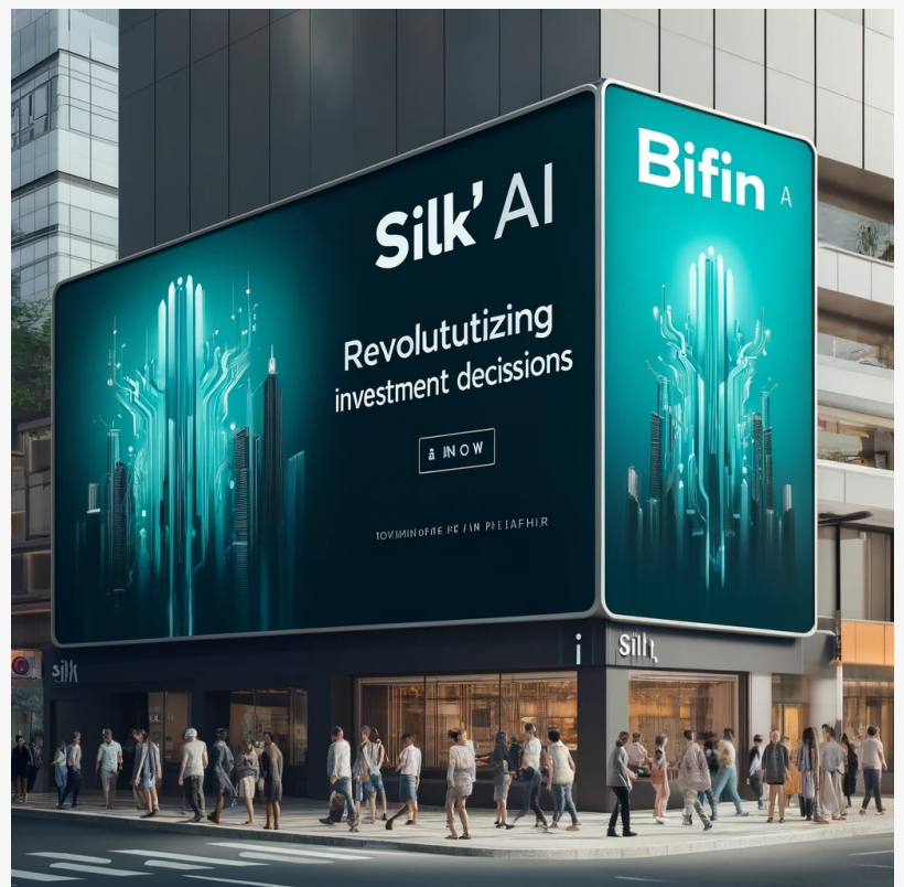
Billboard on a busy city street advertising the Silk platform