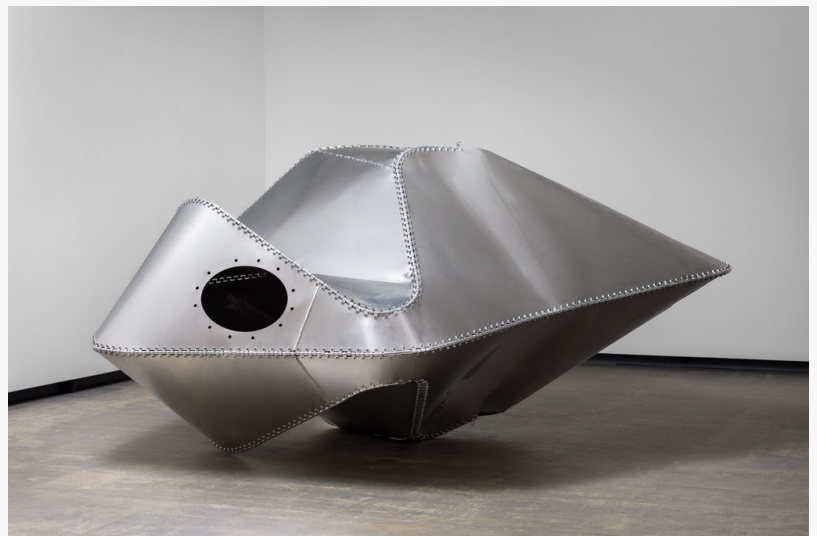
Lunar Base Camp (Snap-through test full scale mock-up/Habitation module)