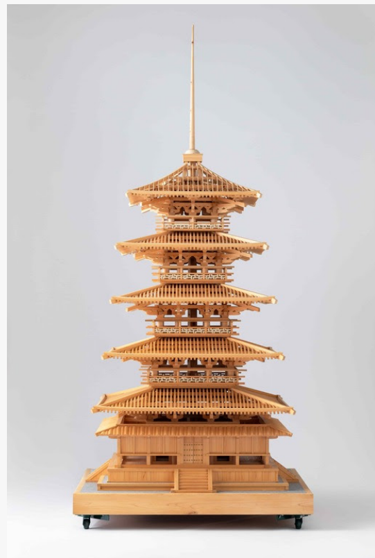
Model of Five-storied Pagoda at Horyu-ji Temple 1/10 scale