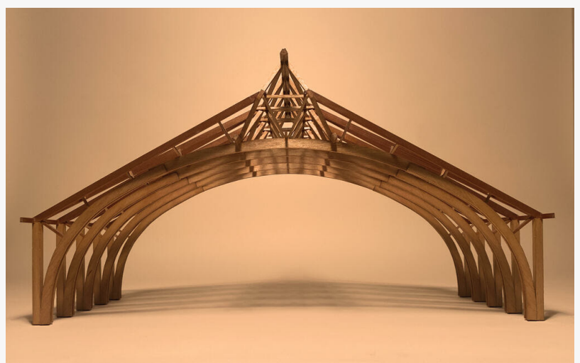
Model of Toba Sea-Folk Museum

- This architectural exhibition, the largest of its kind at our museum, brings together over 100 valuable structural models of well-known architectural masterpieces from all