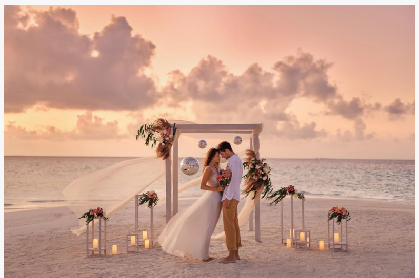
Wedding at Nova Maldives

The "Ocean Promises" package caters to dreamers and adventurers, offering private boat transfers to the Nava Overwater Pavilion for a unique ceremony. Couples can indulge in Maldivian Bodu Beru music and enjoy a two-tier celebration cake amidst a relaxed atmosphere,