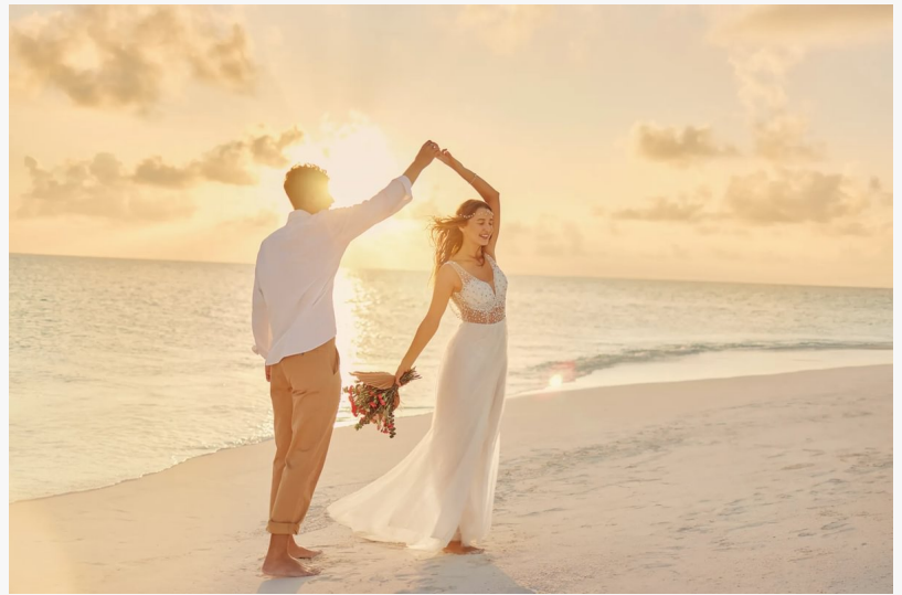
Wedding at Nova Maldives