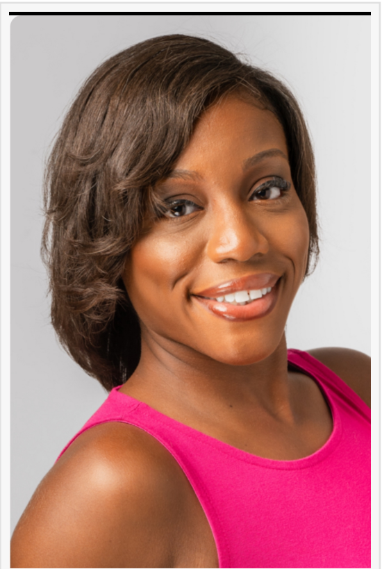
Author Candice L. Woods