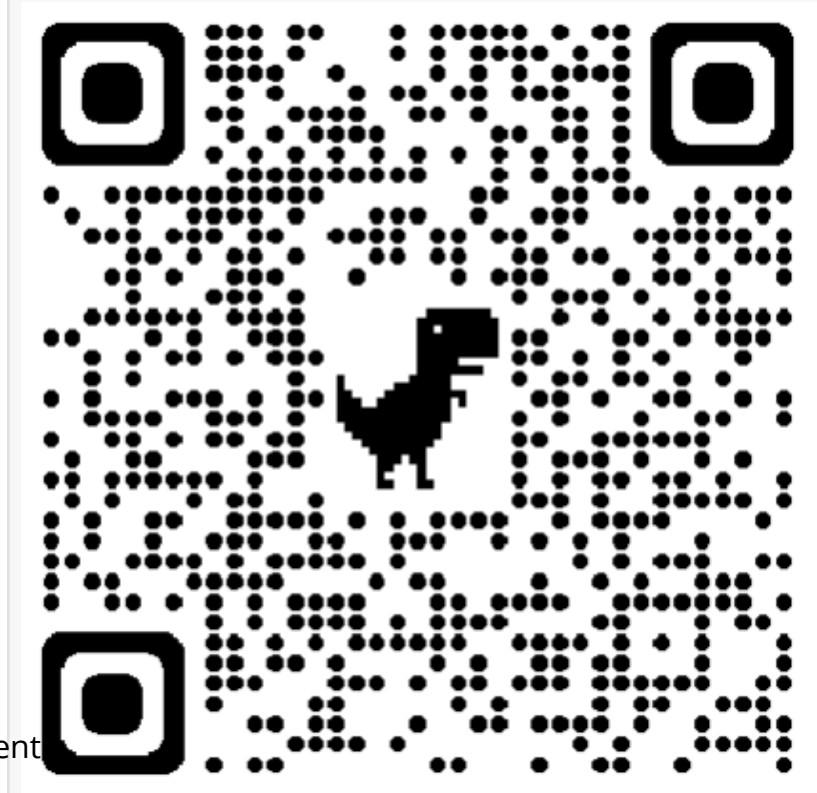
QR Code for AWSCWI.COM Chicago Welding Inspection Service