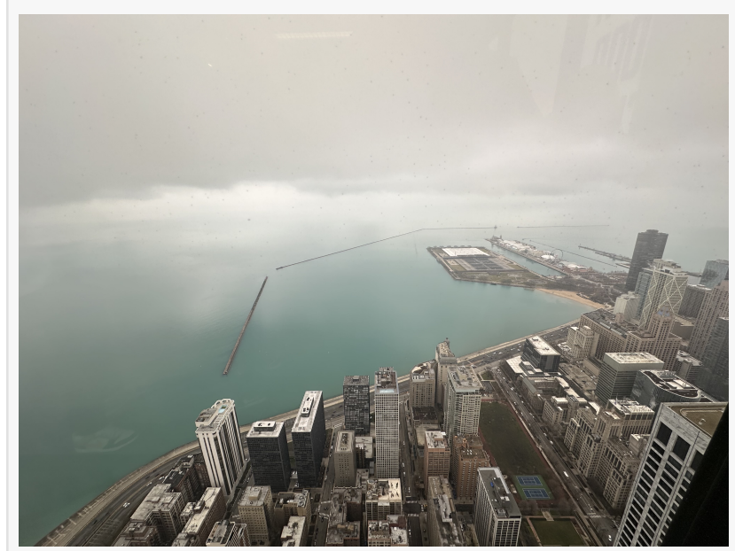
Capturing the essence of viewing Chicago's skyline from the John Hancock Building, a moment brought to life by AWSCWI.COM

This press release can be viewed online at: https://www.einpresswire.com/article/703788125 EIN Presswire's priority is source transparency. We do not allow opaque clients, and our editors try to be careful about weeding out false and misleading content. As a user, if you see something