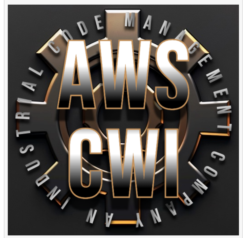
AWSCWI.COM Website Logo

designed to meet this need by providing our clients with the expertise and support necessary to provide accurate code compliant turnover documentation. We are here to help every stakeholder—from the ground up—achieve their project goals with confidence."