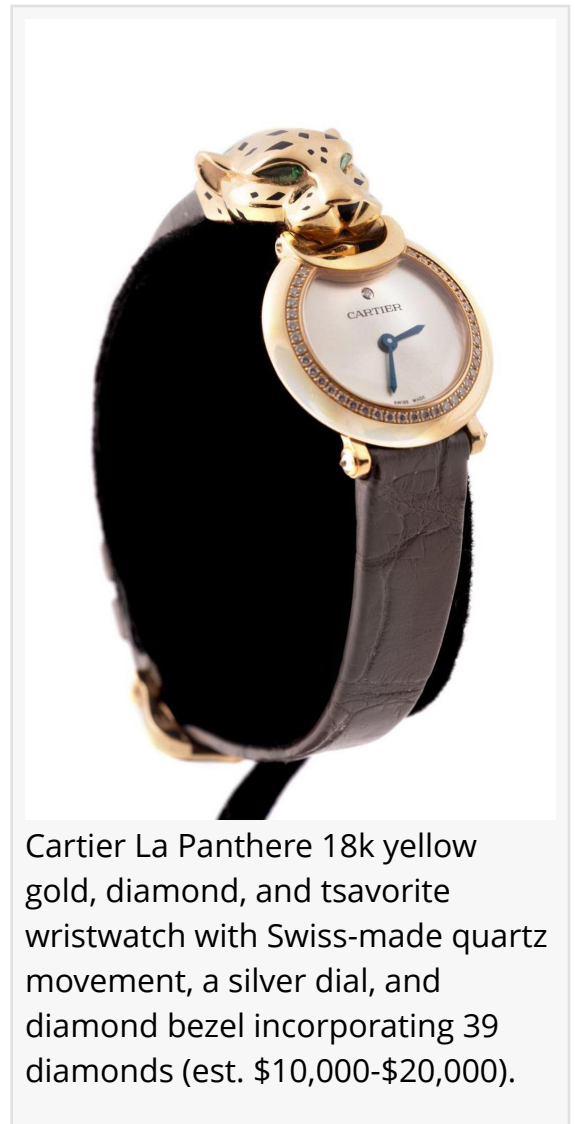
Cartier La Panthere 18k yellow gold, diamond, and tsavorite wristwatch with Swiss-made quartz movement, a silver dial, and diamond bezel incorporating 39 diamonds (est. $10,000-$20,000).