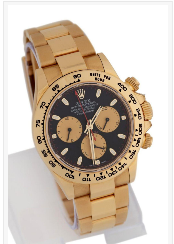
2021 Rolex Oyster Perpetual Cosmograph Daytona 'Paul Newman' 38mm watch in 18k yellow gold with a Swiss-made perpetual movement and three subsidiary dials (est. $45,000-$75,000).

A Rolex Oyster Perpetual Cosmograph Daytona wristwatch, 39mm, with Swiss made perpetual Zenith movement, dial with three subsidiary dials and rubber oyster flex strap with stainless steel flip lock clasp, marked 'Rolex' to the dial and 18k to the case, has an estimate of $18,000-