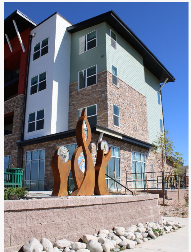
Northwest Apartments, Exterior Art by Gregory Fields

This press release can be viewed online at: https://www.einpresswire.com/article/703869425