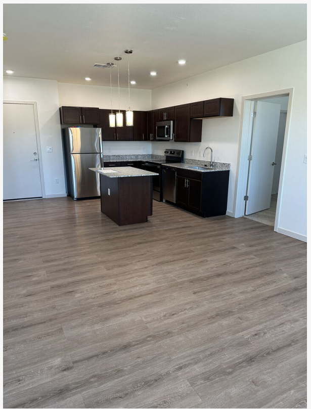
Northwest Apartments Interior Kitchen