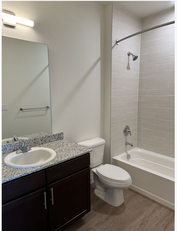
Northwest Apartments Interior Bathroom