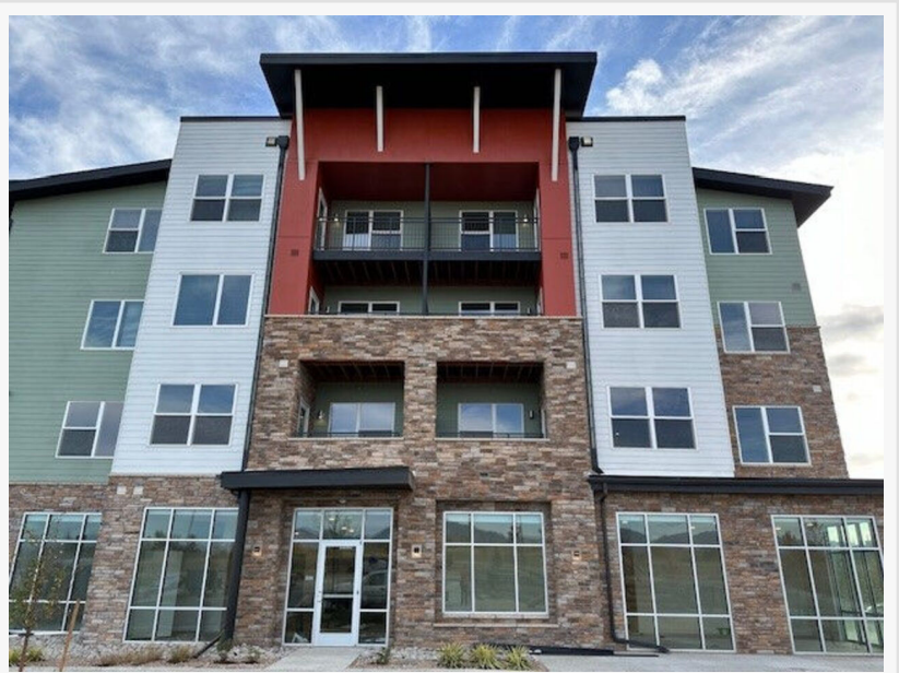
Completed Front of Northwest Apartments

/EINPresswire.com/ -- On the morning of Thursday, April 18, local dignitaries from the City and County of Broomfield, Broomfield Housing Alliance , Colorado Housing Finance Authority, Colorado Department of Local Affairs – Division of Housing and Bank of America are scheduled to join Highridge Costa as speakers to mark the official Grand Opening of the affordable Northwest Apartments in Broomfield.