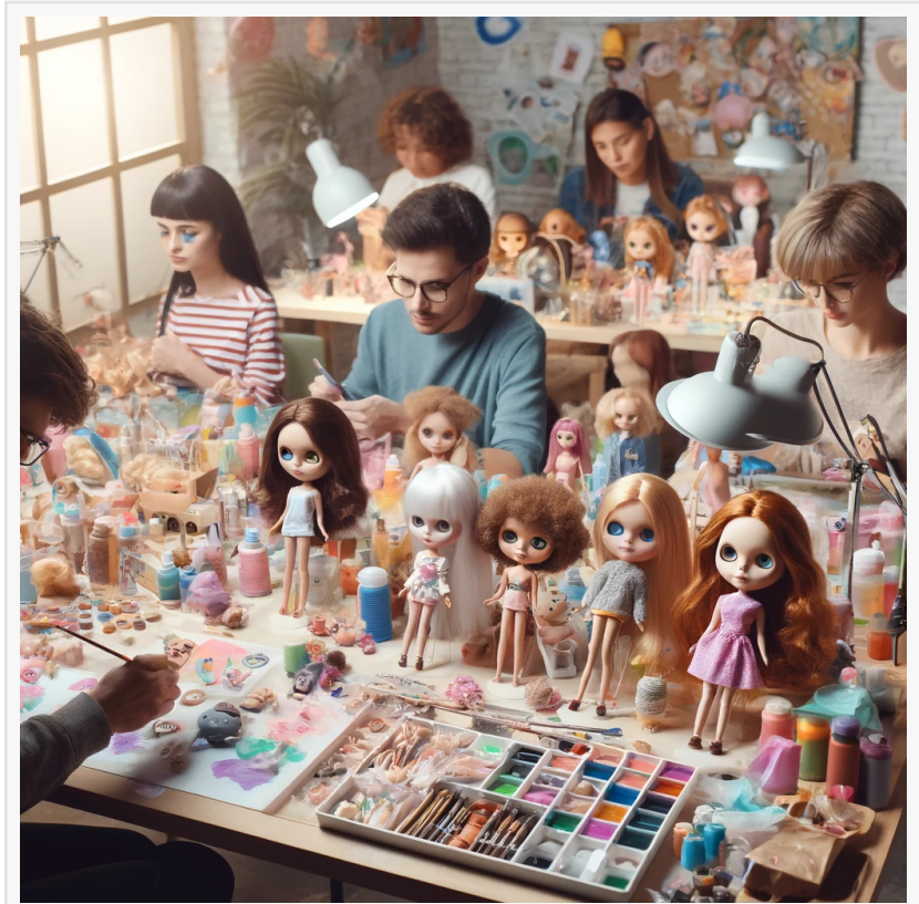
This Is Blythe workshops: Where passion meets creativity in customizing Blythe dolls

In addition to their technological advancements, the company has introduced the "Enchanted Threads" collection, a line of exquisite fabrics designed specifically for Blythe dolls. These luxurious materials not only showcase the company's dedication to quality but also enhance the lifelike movement and grace of each doll's clothing. From shimmering silks to intricately embroidered velvets, the "Enchanted Threads" collection offers a wide range of textures and colors, providing collectors with endless possibilities to create stunning, one-of-a-kind outfits that perfectly complement their custom Blythe dolls. This attention to detail and commitment to providing the finest materials further solidifies the company's position as a leader in the world of custom doll creation.