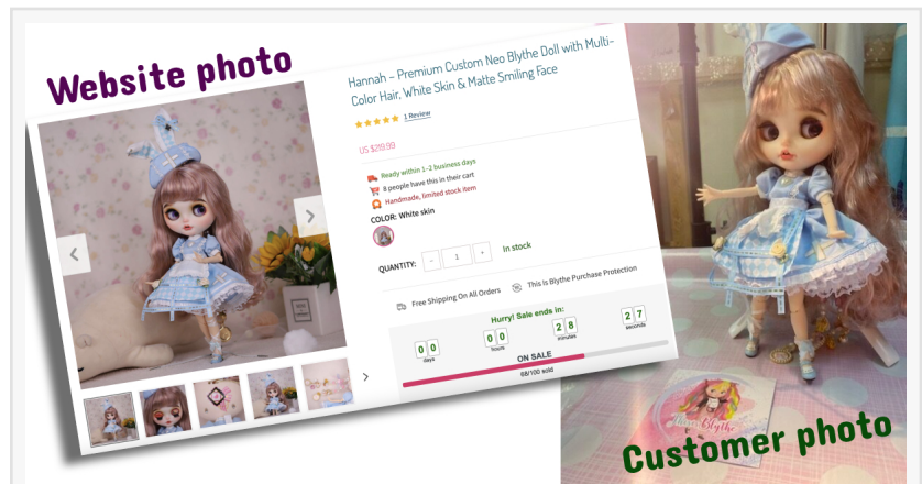
This Is Blythe reviews: A testament to customer satisfaction and quality craftsmanship